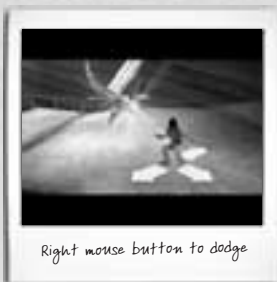
Right mouse button to dodge

The companions take part in the fighting of their own accord, whenever possible, but each one has their own Special Attack and awaits your orders before using it. In some cases, it is vital for Jade and her companions to cooperate well if they want to gain victory in a fight. To ask a companion to use their Special Attack, press the E key.