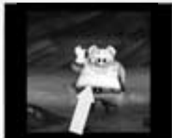
Subject correctly centred.

To direct Jade when fighting, see the Combat & Special Attack section.